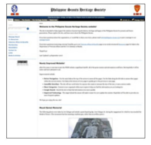
The PSHS website is available at http://www.philippine-scouts.org