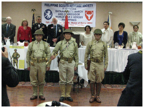
Reenactors in front of the head table during the closing banquet.

The reunion was covered by two local newspapers, the News Tribune and the Tacoma Weekly .