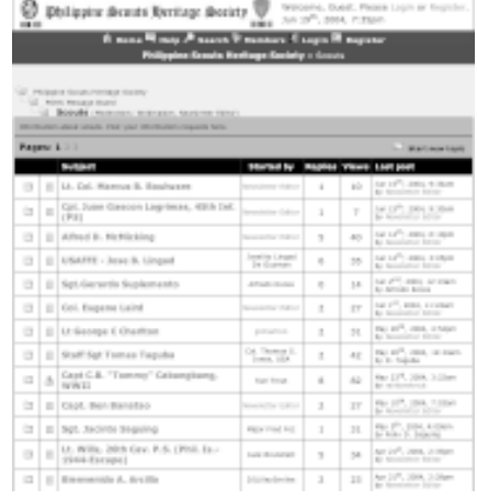
The PSHS Message Board