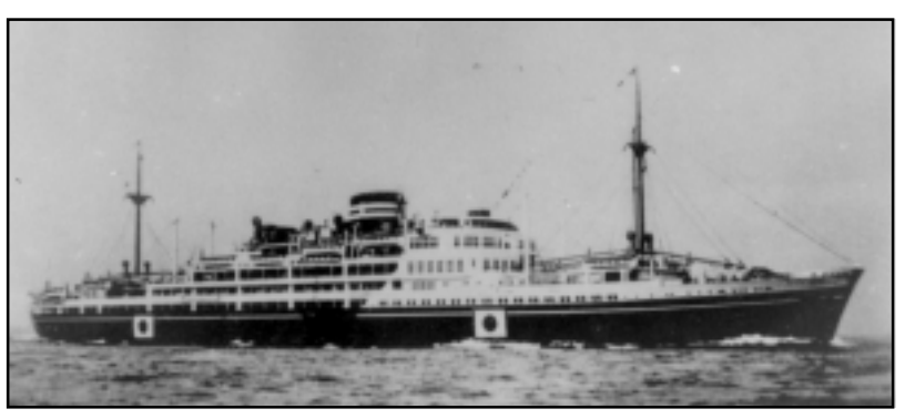
The Brazil Maru was one of the Japanese Hell Ships that transported POWs in unspeakable conditions below deck. The POWs in the Brazil Maru had survived the sinkings of two other Hell Ships, the Oryoku Maru and Enoura Maru. When it arrived in Moji, Japan on January 29, 1945, only 490 of the original 1,619 POWs loaded into the Oryoku Maru in early December 1944 had survived.

The ever dwindling numbers of survivors were unceremoniously dumped in Japan, Korea, Formosa and Manchuria where they worked as slave laborers in mines, plants, chemical factories and other Japanese war industries—again, against all