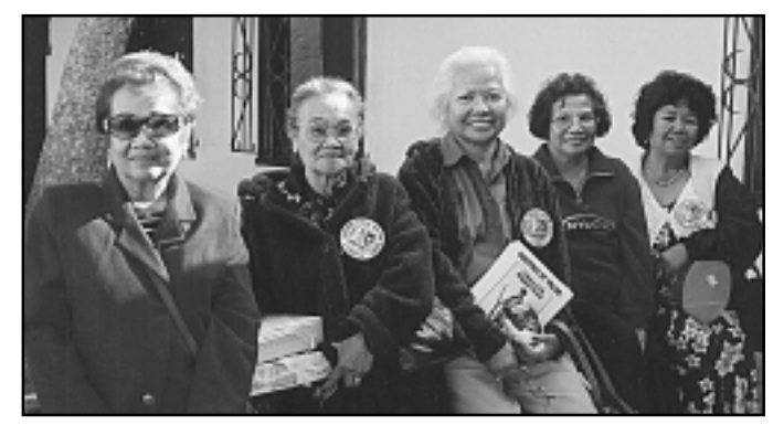
Thanks to the efforts of all who helped plan the event, our distinguished guest speakers and performers, and the support of the Presidio Trust, the Philippine Scouts Centennial left everybody smiling!