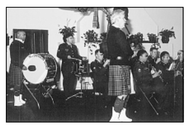
Above: The U.S. Army 91st Division Band was present throughout the Centennial celebration and moved the audience with stirring arrangements of patriotic tunes.

Right: The Philippine Scouts Color Guard and a crack drill team from San Francisco's Abraham Lincoln High School Junior ROTC presented, posted, and retreated the colors during the ceremony.