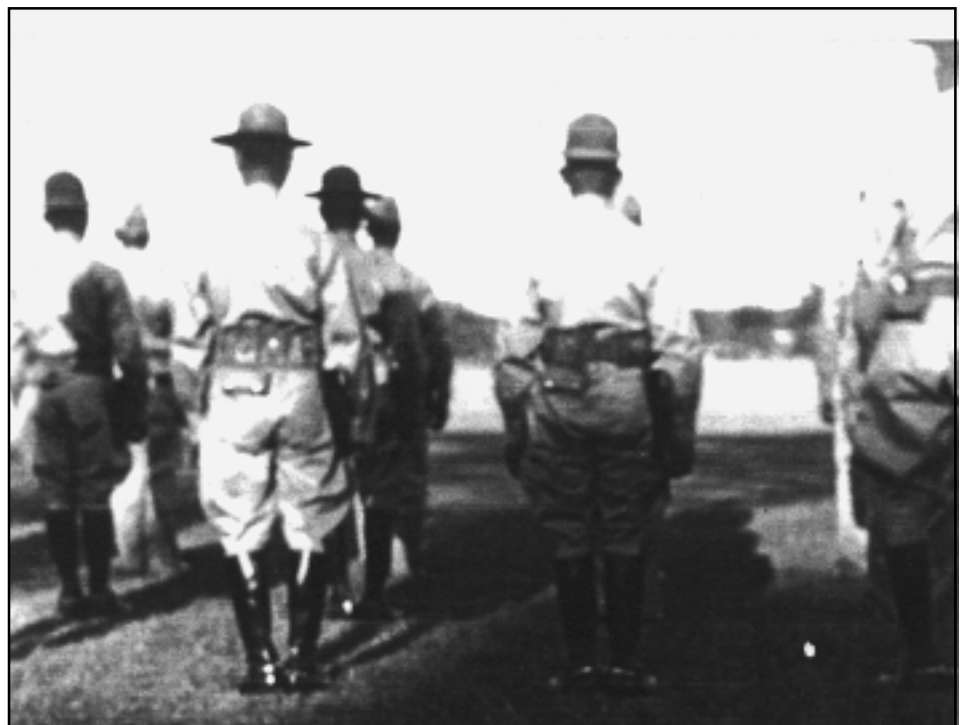
Troops of the 24th Field Artillery (P.S.) on parade ground of Fort Stotsenberg, Philippine Islands, 1940.