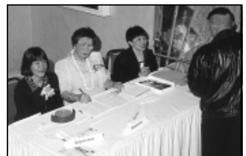
Right: Smiling faces await you at the registration table of the 2001 Annual Reunion! See you there!